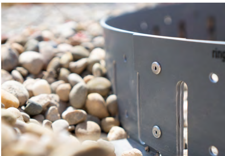
The profile is formed on site and joined with two rivets.