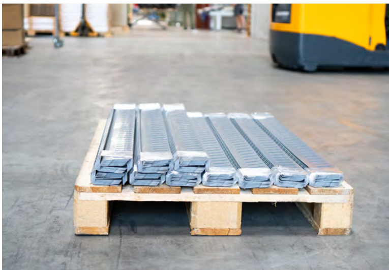
Space-saving for storage & transport: ringo® is supplied as a straight profile.